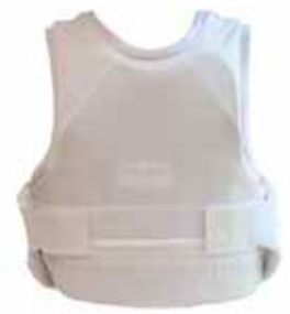
INNER BALLISTIC VEST LEVEL IIIA