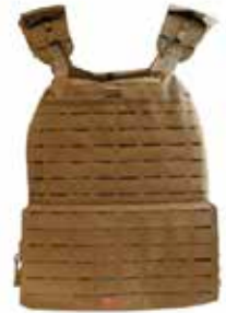
LASER-CUT, PLASTIC-CABLED, EASY-TO REMOVE PLATE BEARING VEST