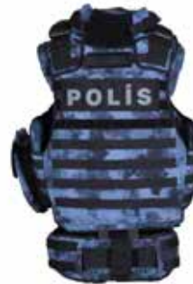
TACTIC VEST WITH WAIST BELT