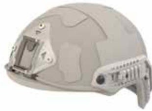
ULTRA LIGHT HELMET ACH HIGH - CUT MODEL