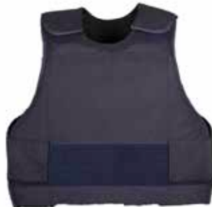
OUTER BALLISTIC VEST