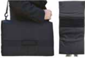
BALLISTIC PROTECTIVE CARRYING BAG