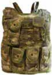
MESHED PLATE BEARING VEST GENDARME