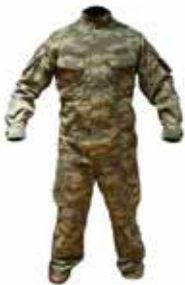
SPECIAL FORCES WINTER PANTS - JACKET - HAT