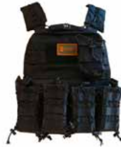
EASY TO REMOVE PLATE BEARING VEST 2 - DOUBLE CABLED