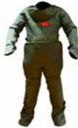
SPECIAL FORCES WINTER PANTS - JACKET - HAT