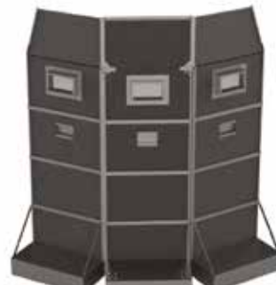
BALLISTIC PROTECTIVE SHIELD